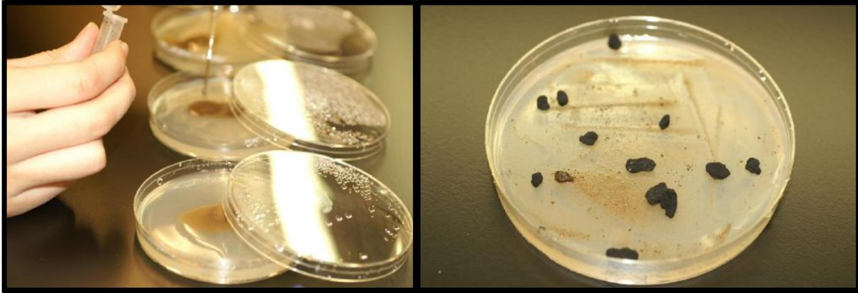
Fig 2. Plating out soil. Left panel: A demonstration of how to divide the dirt dilution onto the hay plates using a glass Pasteur pipette to evenly distribute the dirt dilution over three separate plates. Right panel: Picture of a hay plate after the dirt dilution and K. aerogenes were spread. The charcoal has been sprinkled throughout the plate and not centered in one spot. The best way to get this type of pattern is by placing the sterilized charcoal in a sterilized 50ml Falcon tube and gently hitting the side of the Falcon tube to sprinkle the charcoal onto the plate.