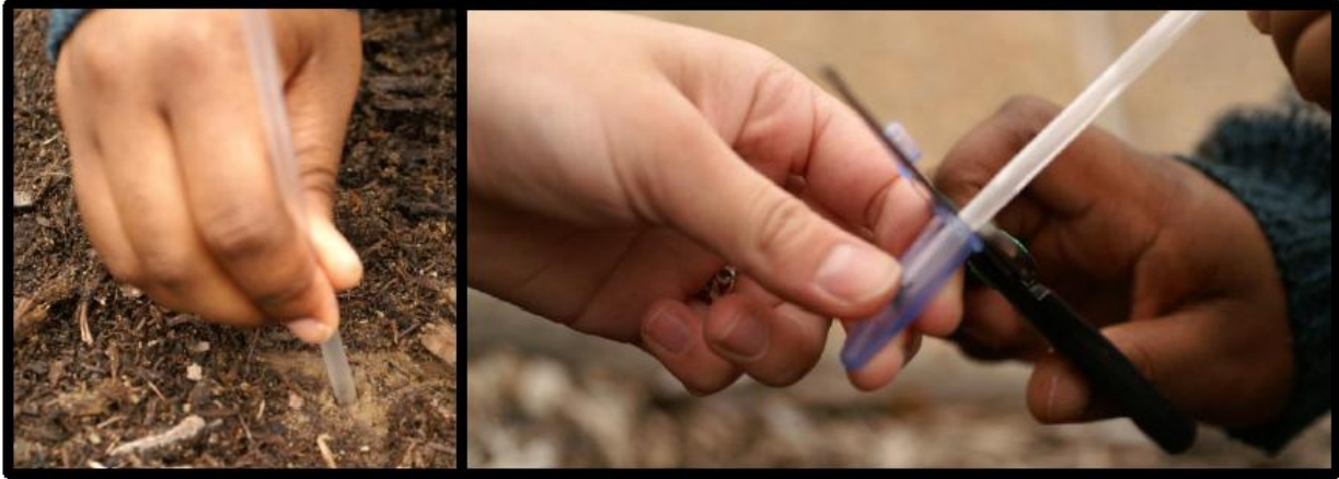
Fig 1. Collecting soil using the straw method. Left panel: A demonstration of how to insert the straw into the dirt after removing the top layer of leaves. Gently push the straw into the dirt for about a centimeter. Right panel: A demonstration of how to cut the straw into the microcentrifuge tube. Cut the straw using sharp scissors about an inch from your soil sample. Make sure you have room to close the microcentrifuge tube.